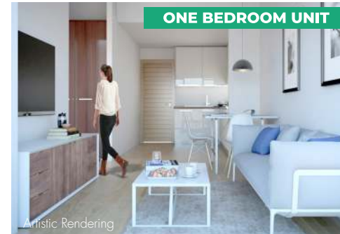
ONE BEDROOM UNIT

☎ 0917 627 5108 🌐 miramontiph 🌐 miramonti.italpinas.com