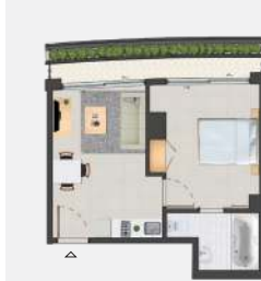
1 BEDROOM A Approx. 39 sq.m. (including balcony)

*Furnitures not included | *Fully-furnished units available upon request only