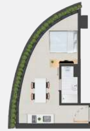
STUDIO E Approx. 27 sq.m.

Miramonti is an integrated property development, located in St. Tomas, Batangas, comprised of residential condominium units, serviced apartments, office spaces, and commercial areas. Imagine being far from the city's chaos but near to work and school, and enjoying the peace and safety of your home with world-class amenities and the convenience of in-house shopping and dining.